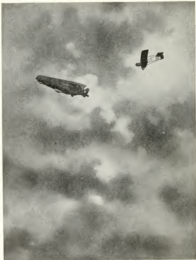
ZEPPELIN ATTACKED BY RUSSIAN AEROPLANE.

heretofore secure from danger. At the same time the bold aggressors themselves face death in new forms, by suffocation under water, by falling to death from enormous heights, and in many other ways. Land forces must now be