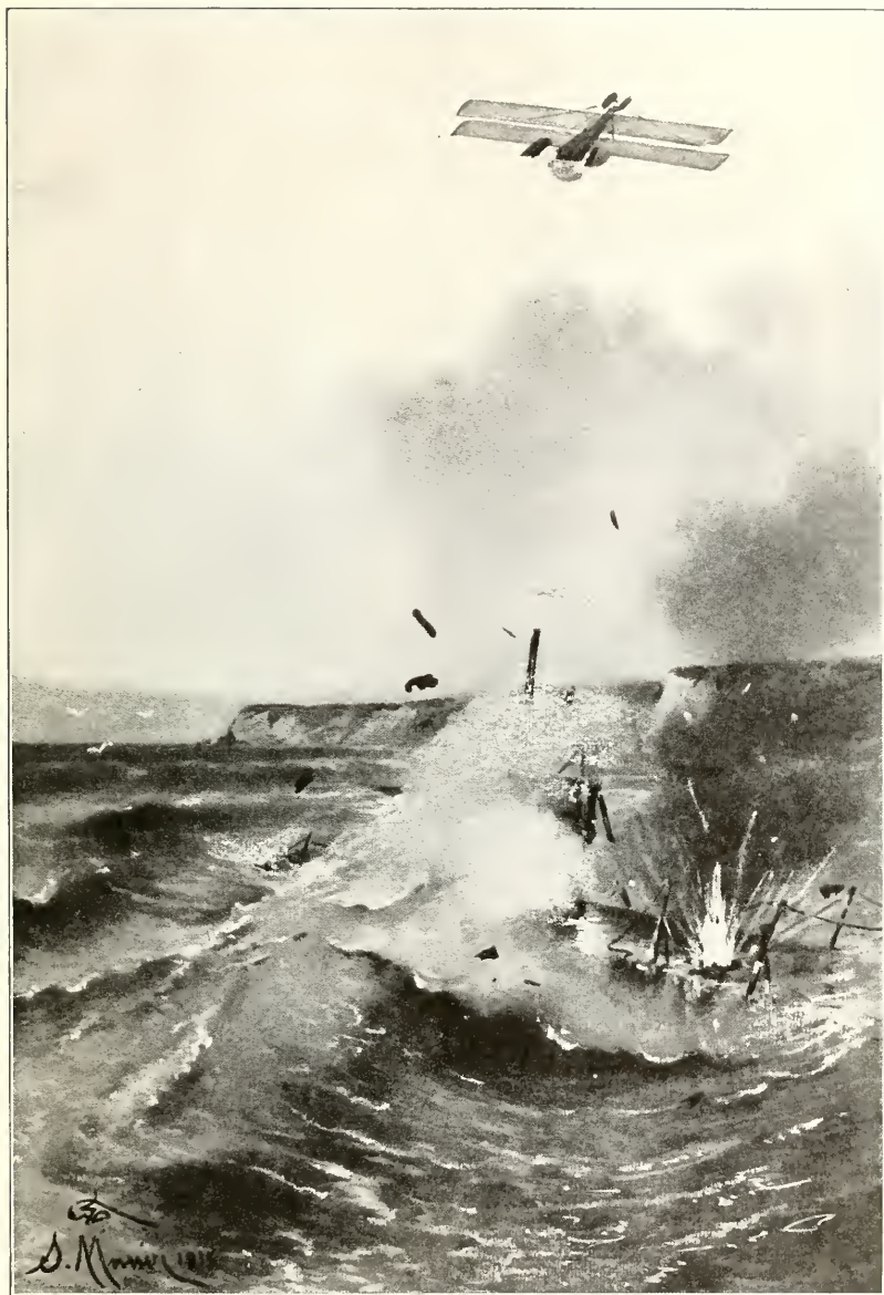
TURKISH AEROPLANE SINKING SUBMARINE OF THE ALLIES NEAR THE COAST OF BULAIR.