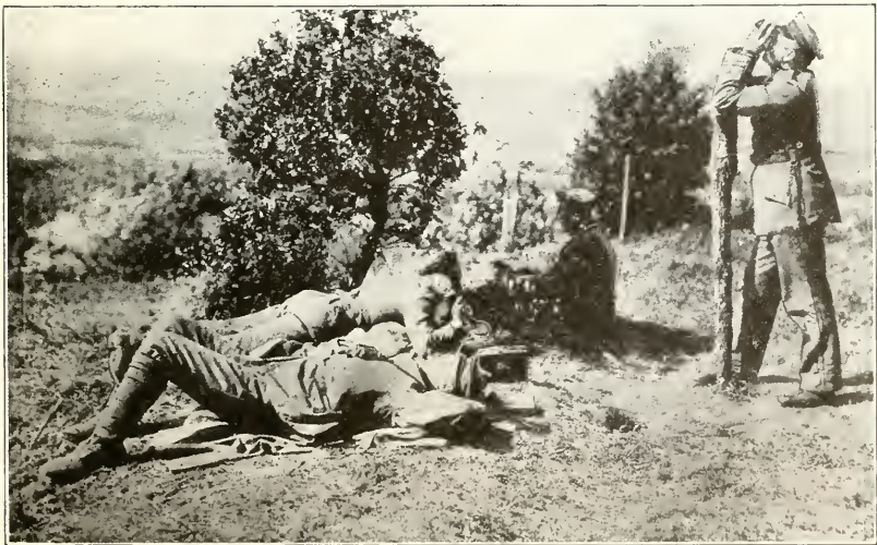
OBSERVATION POST ON THE LOOKOUT FOR RUSSIAN FLYERS.