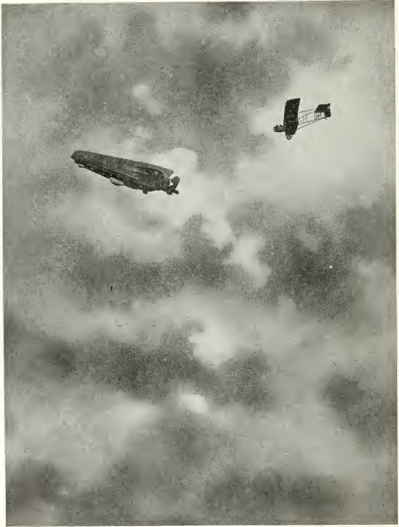
ZEPPELIN ATTACKED BY RUSSIAN AEROPLANE.

heretofore secure from danger. At the same time the bold aggressors themselves face death in new forms, by suffocation under water, by falling to death from enormous heights, and in many other ways. Land forces must now be