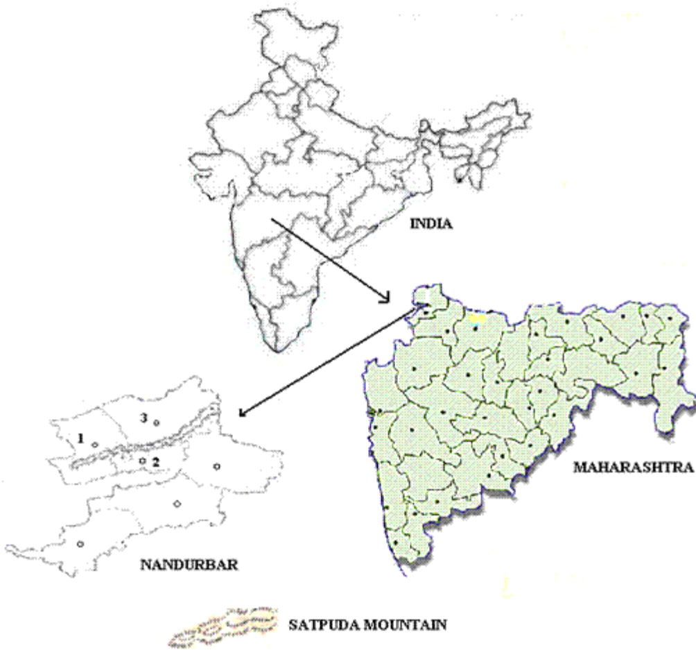
Figure 1: Spot map showing location of Satpuda Mountain to be investigated tahsil 1) Akkalkuwa, 2) Taloda 3) Dhadgaon of Nandurbar district, Maharashtra.