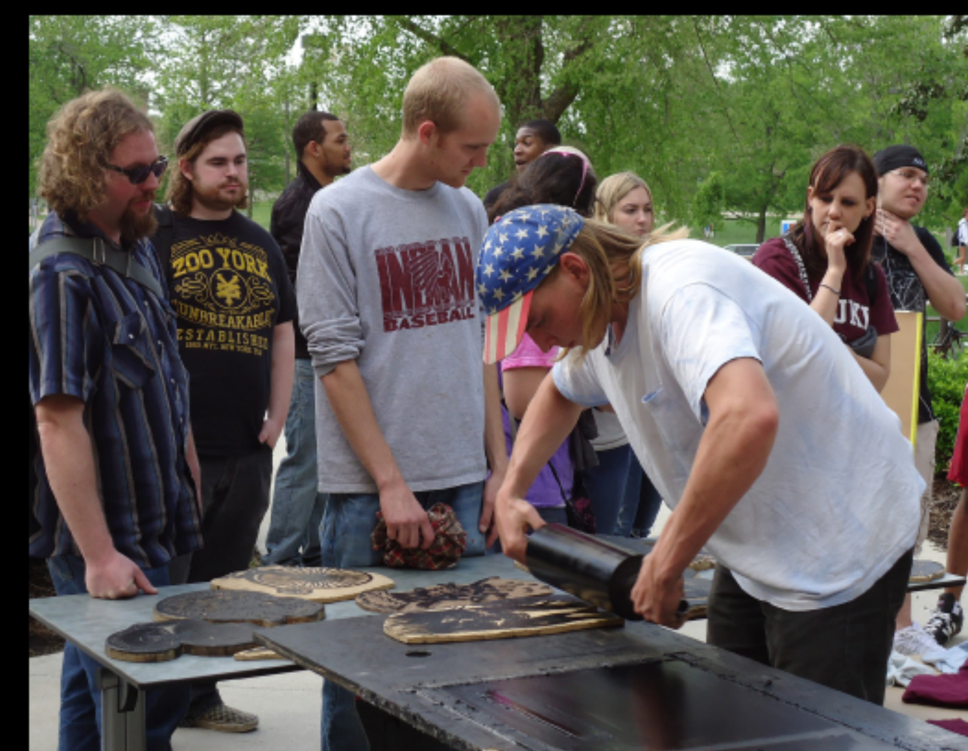
DRIVE BY PRESS PRINT EVENT

Woodblock Woodstock was sponsored by SIUC's School of Art & Design, The Friends of Morris Library and Morris Library.