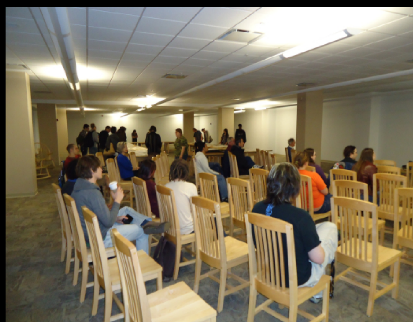
DRIVE BY PRESS LECTURE