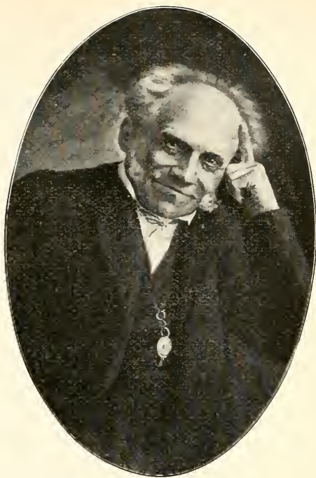
SCHOPENHAUER IN 1852.

From two daguerreotypes, highly prized by Schopenhauer, now in the possession of Elisabet Ney. They represent the sitting when Schopenhauer drank the historical bottle of wine to remove his wonted lugubrious and pessimistic cast of countenance.