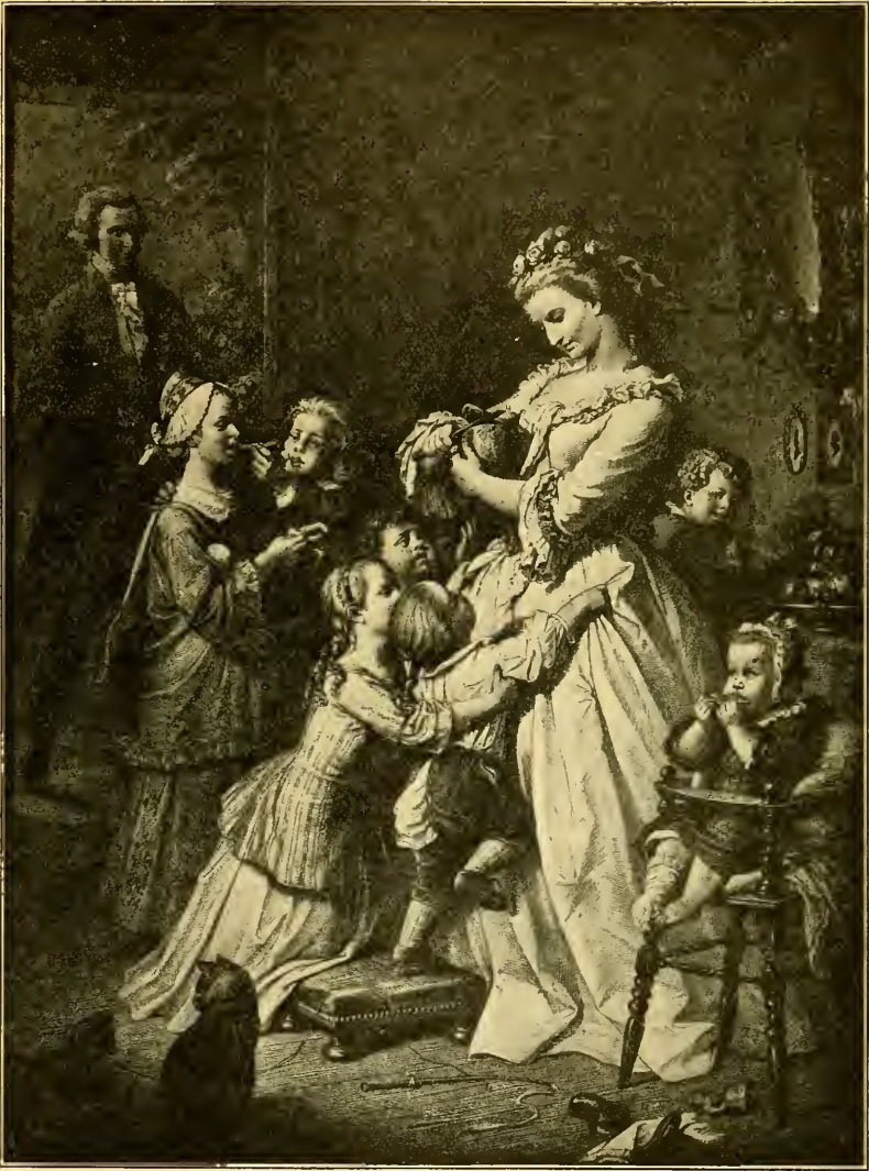
WERTHER'S LOTTE By Kaulbach