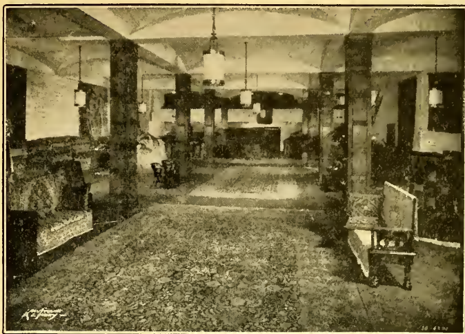
A view of one of the four huge floors at Nahigian Brothers