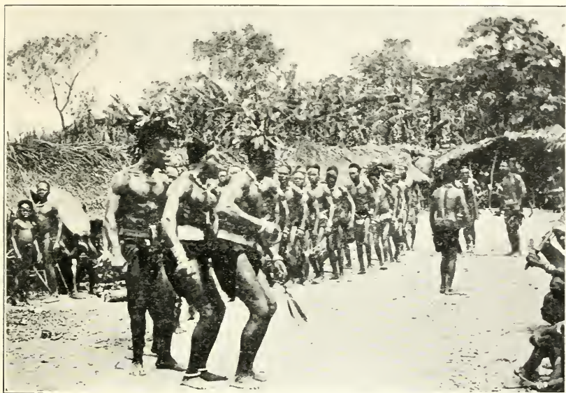
Fig. 35. FUNERAL DANCE AT UPOTO, UPPER CONGO.

On the death of an adult, the natives of the Upper Congo, male and female, dress themselves up in all their finery and walk in single file round and round the grave, singing and shouting the praises of the dead as they go, the whole village looking on. When passing the hut of the dead person, they plunge their spears into the roof, apparently to frighten away the ghost. This dance lasts from eight