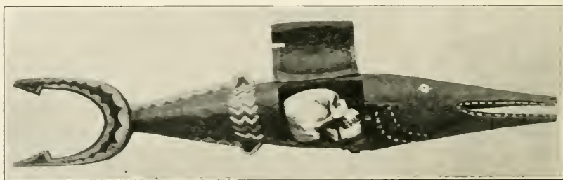
Fig. 34. "FISH-COFFIN" OF THE SOLOMON ISLANDERS. British Museum.

Many Indians of America cremate the dead. The body is kept in a lodge for a few days. At the end of that period it is laid upon logs which are then ignited. Beside this pyre the widow must sleep for nine days, from sunset to sunrise. While the corpse is being consumed the widow collects some of the juice from the body and rubs it on her own body and face. The bones are afterward collected and carried about for a period of years corresponding to the depth of her affection (see Fig. 38). At the end of this period, a certain ceremony, lasting some months, is performed in order to remove her mourning. The bones are taken off her back and fastened to a post. She is praised for being a good and faithful wife: bird's down and oil (see Fig. 39) are put on her head, and she is then at liberty to marry again.