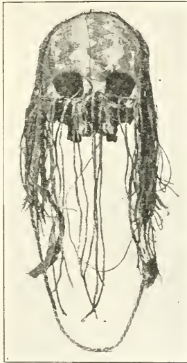
Fig. 38. PAINTED SKULL OF AN ANDAMAN ISLANDER, WORN AROUND THE NECK BY A MOURNER.

remains in the ground near the body, occasionally coming up, taking a look round, and then returning again to earth. The appearance of the spirit is eagerly looked for in order to ascertain how the deceased met his death. Nothing is buried with the body, but in the case of a man his bows and arrows are stuck at the head of the grave; if the deceased be a woman her petticoat is fastened there on a stick. Over the grave a small platform is erected and on this is placed sago, yams, bananas, and fish for the spirit to eat. A fire is lighted at the side of the grave and kept burning for nine days, so that the spirit may warm itself.