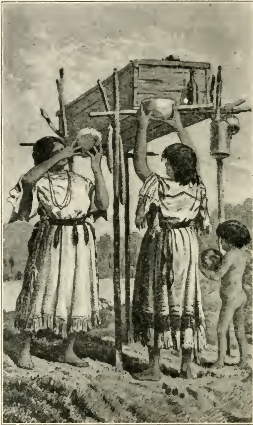
Fig. 37. NORTH AMERICAN INDIANS OFFERING FOOD TO THE DEAD MAN'S SPIRIT.

to bring them wealth and strength. They consider the closer the hair is cut, the greater is the sign of mourning. The Loucheux cut the hair close to the head, and sometimes, in their frenzy, kill some poor friendless stranger who may be sojourning with them.