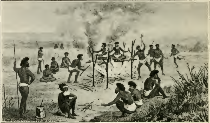
Fig. 33. CREMATION OF THE DEAD IN AUSTRALIA.

One Australian tribe has such a great fear of the dead man's spirit that it takes special precautions to prevent the body rising from its grave. The toes of the corpse are tied together, the thumbs behind the back. Every evening a clear space is swept round the grave, and in the morning a close inspection is made to discover