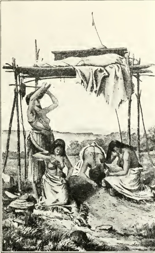
Fig. 36. SIOUX WOMEN, CUTTING THEIR HAIR AND MUTI-LATING THEIR BODIES AT THE GRAVE.

with a tomahawk, while the mother burns her breast and abdomen for hours and hours at a time, frequently with such severity that fatal results ensue. In other cases, women dig their sharply-pointed yam sticks into the top of their heads until blood falls in streams