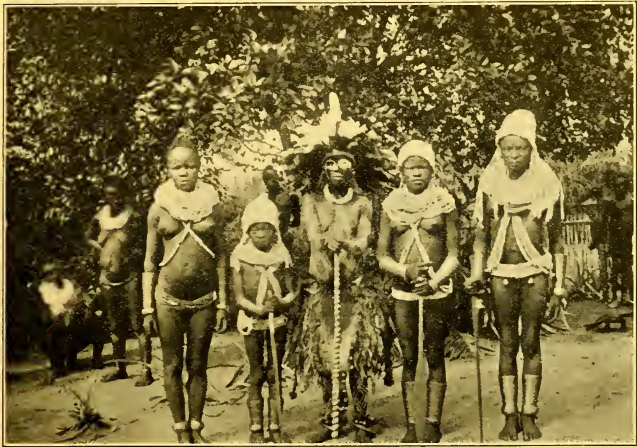
Fig. 27. LADY WITCH-DOCTOR AND HER ATTENDANT DANCING WOMEN, UPOTO, UPPER CONGO.

As I have said, the idea of nature and natural causes is altogether foreign to the savage mind. Nature, as we understand it, is to them not physical, but spiritual in essence. Everything has a "magical" origin or cause, instead of a "natural" one. Death itself is seldom natural; man apparently would continue to live were he not