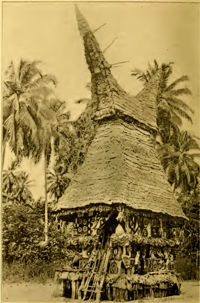
Fig. 26. HOUSE OF GHOSTS, BERLIN HARBOUR, NEW GUINEA.

The spirits ruling fate live in these houses. There are carefully executed paintings on the gable ends and walls, and remarkable carvings on the balustrades.