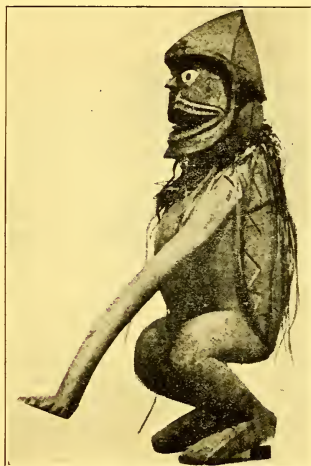
Fig. 24. WOODEN FIGURE SET UP BY THE NICOBAR ISLANDERS TO SCARE AWAY EVIL SPIRITS.

Savages do not believe in a personal omnipotent God, nor in the Devil; but they do believe in the existence of ghosts or souls, and in a multitude of good and evil spirits. While they make unto themselves images of wood and of stone and bow down to them they never worship the image itself, but the spirit which is supposed to reside therein. Savages are not such fools as some think. Many of their supposed idols or gods are really scarecrows or spirit-