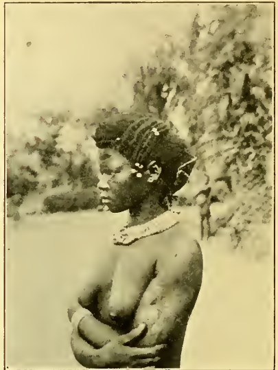
Fig. 12. UPOTO, "KELOIDS" ON FACE AND CHEST. Fig. 13. BOPOTO TRIBE, SHOWING COIFFURE.