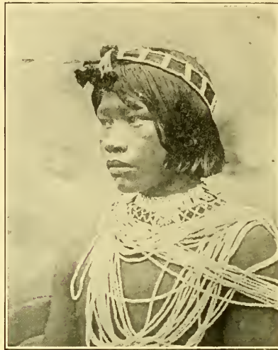
Fig. 14. LENGUA INDIAN OF PARAGUAY.

The Yaos, Anyanja, and other races of East and Central Africa shave the head and never let the hair grow more than two inches in