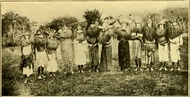
Fig. 10. MYSTERY RITE OR "NLANGO" CUSTOM AT KIBOKOLO, UPPER CONGO.

One of the most mysterious and, at the same time, most remarkable rites undergone at this period is the custom so well known to us from Biblical sources (Lev. xii. 3). At one time it was held to be the peculiar, if not the exclusive, ceremony of the Jews; but it is practised by savages all over the world. Its origin is wrapt in mystery; no reason can be given for the custom even by those who