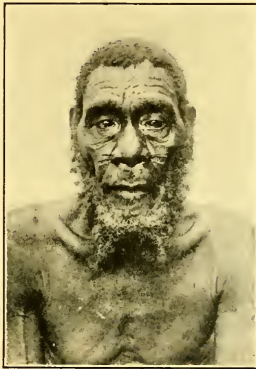
Fig. 11. NATIVE OF NEW BRITAIN, Showing nose-sticks worn through the perforated nose.

In Central Africa, women were seen who passed their tongues through the holes and licked their noses. Nor is the tongue itself forgotten; one young lady had no less than five rings fixed in hers.