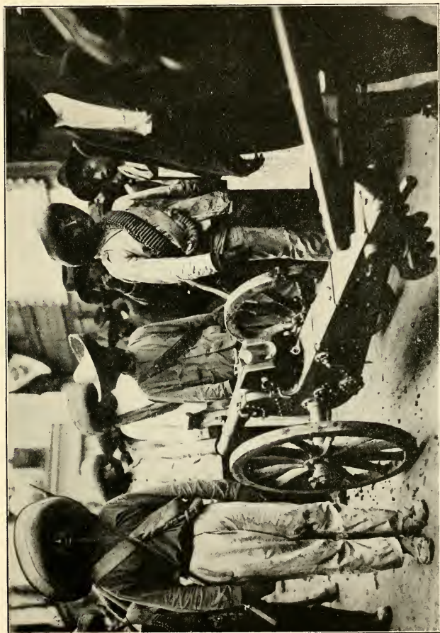
TYPICAL MEXICAN SOLDIERS IN THE STREETS OF MEXICO CITY.

fallen and fight over his body with an Amazonian fury equaled only by a mother wild beast defending her young.