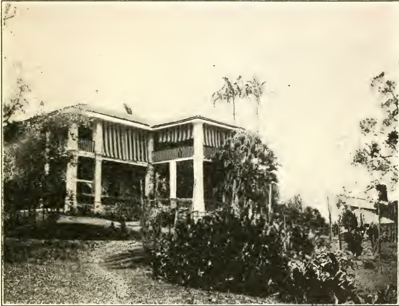
HOME OF THE MANAGER OF THE BUKIT TIMAR RUBBER ESTATE NEAR SINGAPORE.

The Bukit Timar is an up-to-date plantation of more than one hundred thousand trees, and here we saw the whole process, from tree to sheet rubber, as shipped to all parts of the world and sold by the pound. Rubber trees grow to a considerable size, but this being a young plantation most of the trees were not over six or eight inches in diameter. In the middle of the estate was a very attractive bungalow where lived the manager and his wife, a young