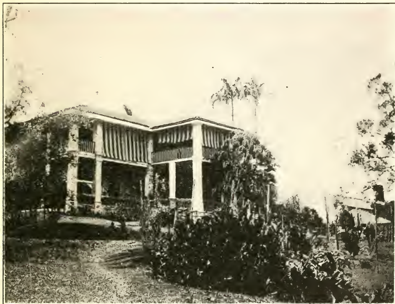
HOME OF THE MANAGER OF THE BUKIT TIMAR RUBBER ESTATE NEAR SINGAPORE.

The Bukit Timar is an up-to-date plantation of more than one hundred thousand trees, and here we saw the whole process, from tree to sheet rubber, as shipped to all parts of the world and sold by the pound. Rubber trees grow to a considerable size, but this being a young plantation most of the trees were not over six or eight inches in diameter. In the middle of the estate was a very attractive bungalow where lived the manager and his wife, a young