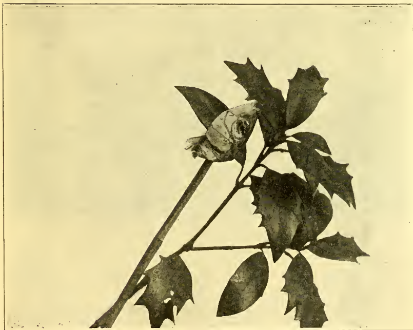
SARDINE'S HEAD AND HIIRAGI.

THERE is an old religious custom in Japan still observed by some conservatives which consists in exposing a sardine's head together with a spray of hiiragi ( Osmanthus aquifolium ) at the