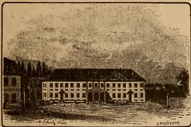
THE THEATER OF WEIMAR IN GOETHE'S TIME.

The Open Court Publishing Company CHICAGO