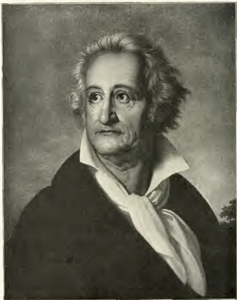
PORTRAIT OF GOETHE.