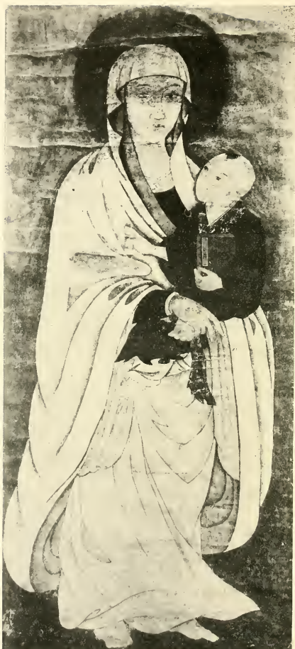
A CHINESE MADONNA.