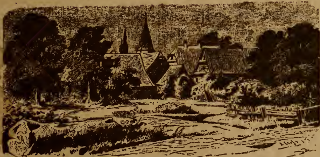
SESENHEIM, THE HOME OF GOETHE'S FRIEDERIKE.