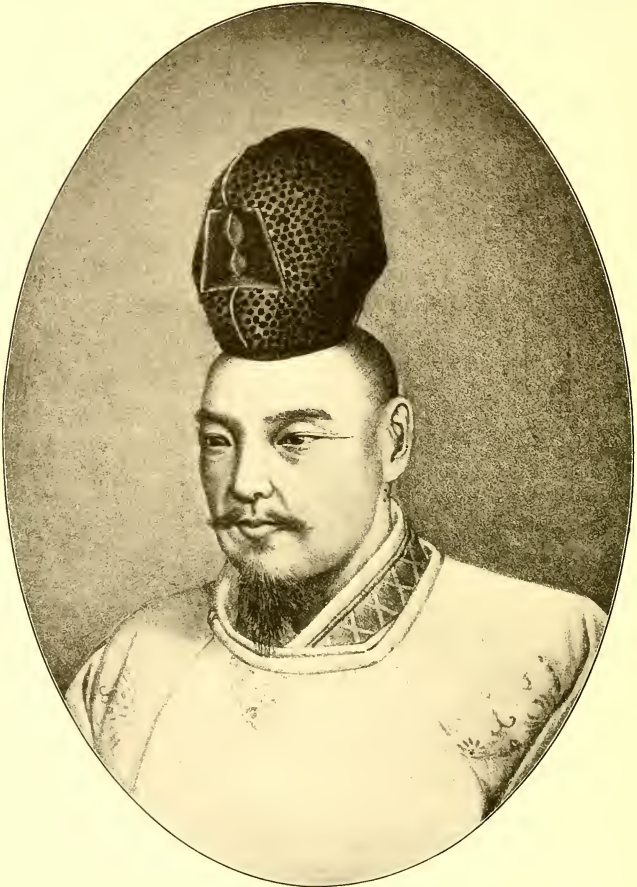
NARIAKI, PRINCE OF MITO.

triotism inculcated by Shinto, brought about a remarkable result." "The union of Chinese philosophy with Shinto teaching was still