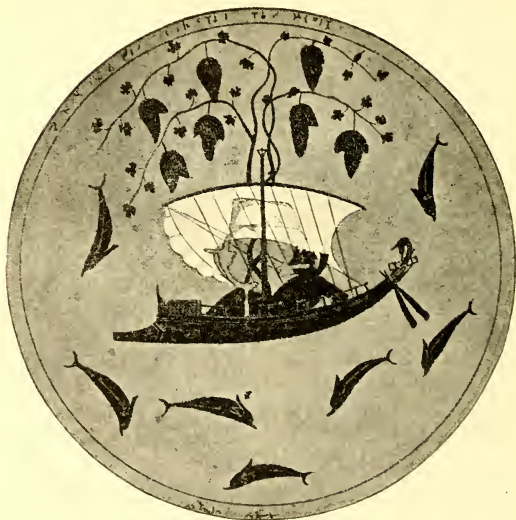
DIONYSUS CROSSING THE SEA.