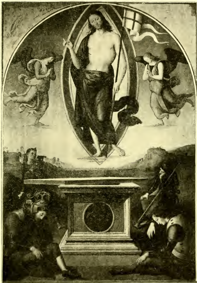
THE RESURRECTION OF CHRIST. By Perugino. (Vatican.)