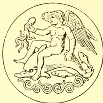
EROS ON A DOLPHIN.

life. The idea is at once modern and ancient, modern in so far as it preaches an immanent immortality, and ancient because it utilizes the mythology of pagan Greece, which attributes to Eros, the god of love, the power of descending into Hades and returning back to