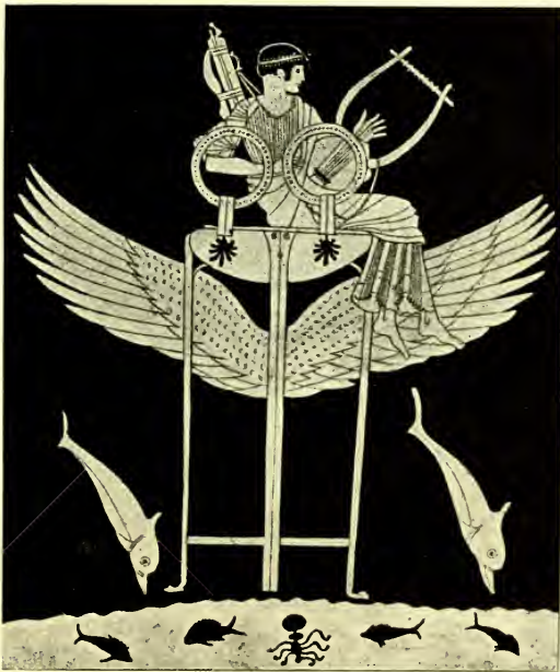
APOLLO ON HIS TRIPOD FLYING OVER THE OCEAN.