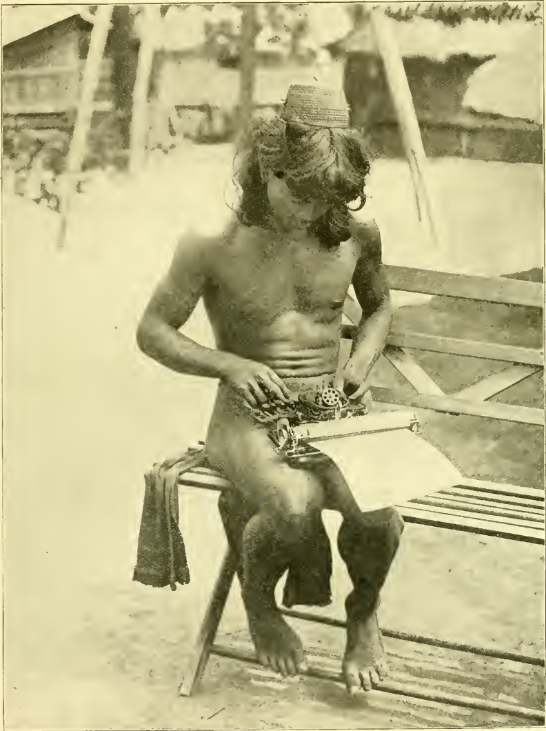
THE SPREAD OF CIVILISATION—THE TYPEWRITER.