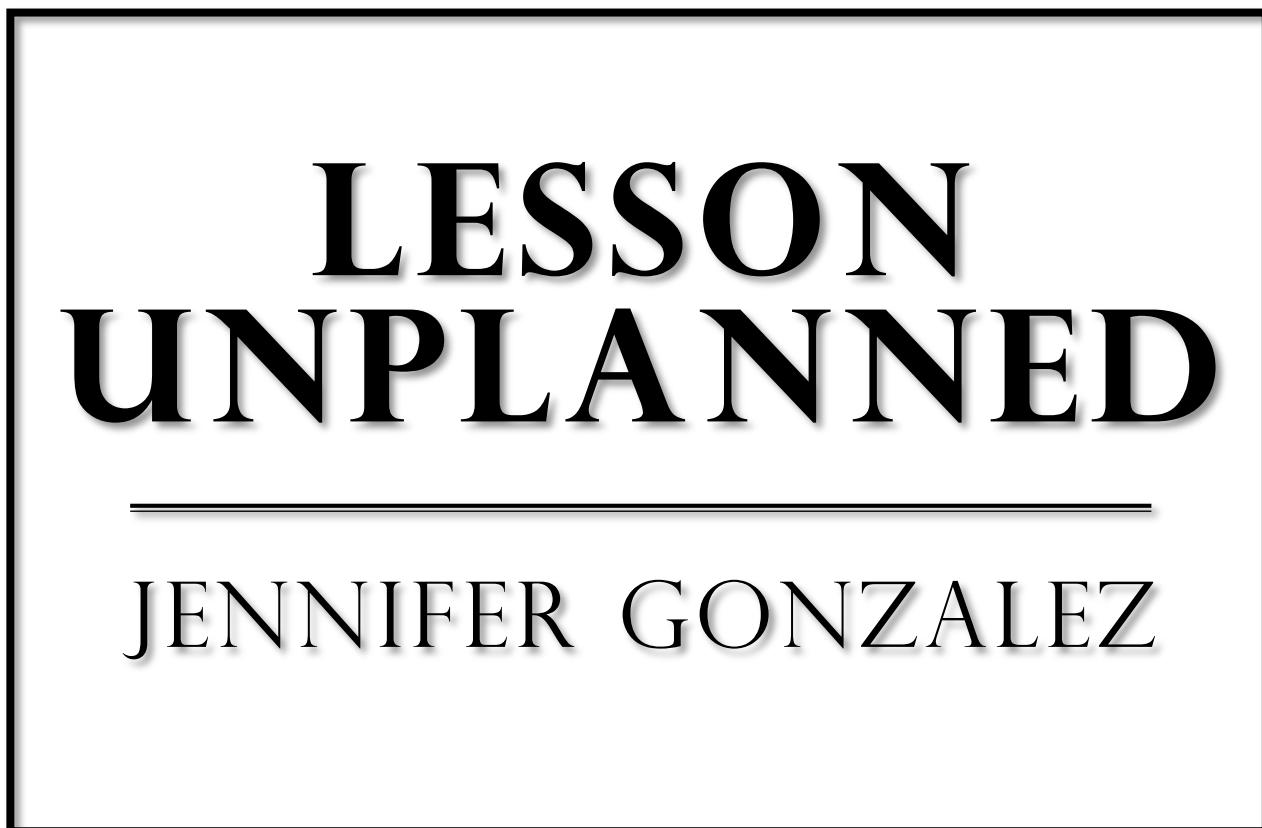
Figure 1: Title Card, The project title and artist name displayed at the beginning of the print exhibit.

A print exhibit was created as a visual aid to complement the documentary to create a multimedia experience combining the use of moving and still imagery. Each slide represents the component included in the print exhibit. Image captions included in the print exhibit are included below each respective image.