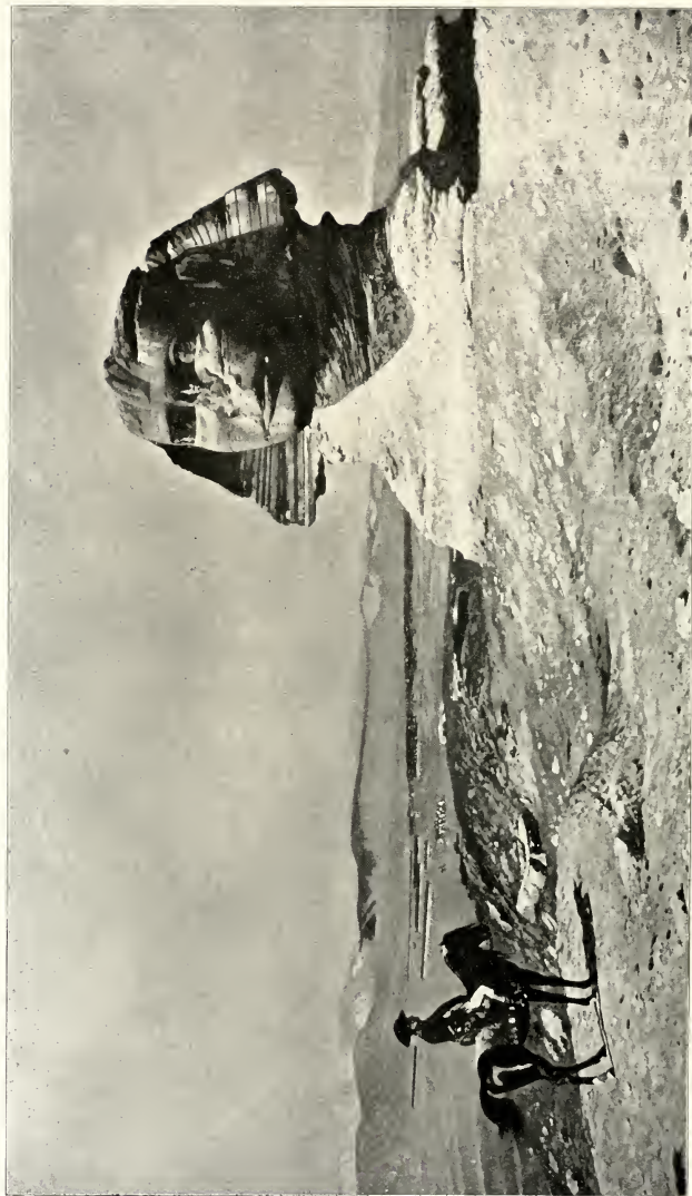
NAPOLEON BEFORE THE SPHINX. (By L. O. Meson.)