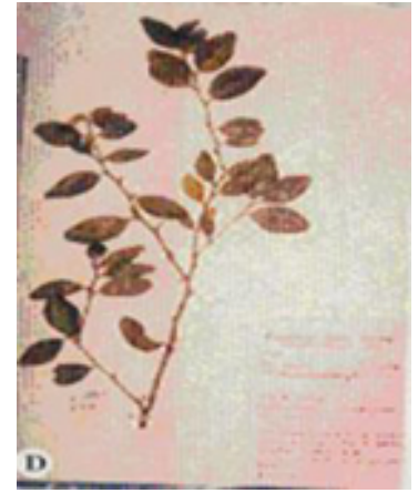
Atalantia monophylla –Seed oil for rheumatism