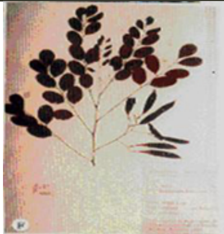
Dalbergia paniculata - Leaf paste for rheumatism