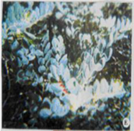
Breynia vitis-idaea –Leaf paste for rheumatism