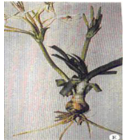
Crinum defixum –scale leaves of tuber layers applied on swellings of testis