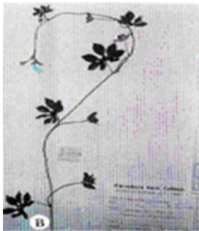
Ipomoea pestigritis – Leaf paste applied on painful swellings