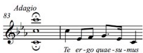
Figure 3, Adagio section, main theme

The final section of the Te Deum is introduced in measure 93. Without warning, Haydn moves seamlessly from the adagio C minor to the allegro con spirito C major. The transition is quite abrupt, giving a most shocking effect for the listener. The full orchestra returns with the choir and the declamatory and celebratory air of the opening section is quickly restored.