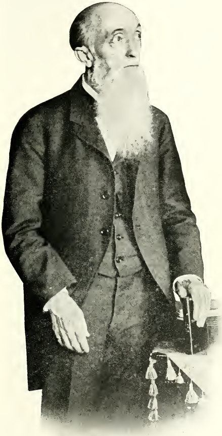
AS HE APPEARED WHEN OPENING THE PARLIAMENT OF RELIGIONS.