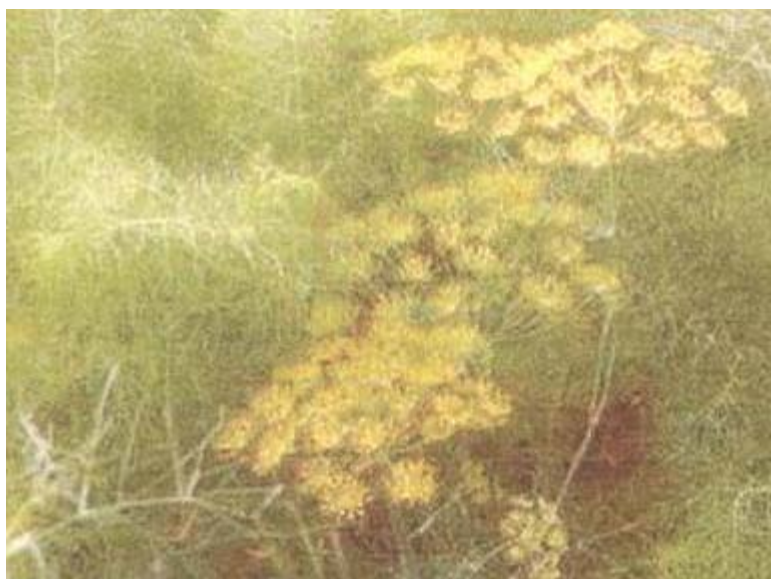
Foeniculum vulgare in the flowering season

Furthermore all chemicals used in this study were analytical grade (Sigma and Merck ) and were imported from abroad.