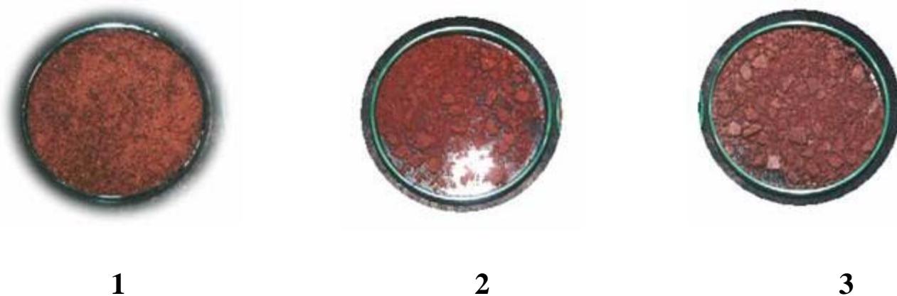
Figure 1. Phytohormones (Saponin) extracted from seed of Foeniculum Vulgare .

proteins, amino acid and fats were present in these samples. The leaves contained higher concentration of flavonoids and fat. Whereas the level of saponins, protein, amino acids and other organic compounds were high in seeds. (Tables 1-6 and Figs 1-2) . The seeds of Foeniculum are considered as essential ingredients for many local medicines those can used against stomach, kidney and liver infection and disorders. (Etherton, 2002: Matin et al. 2002). The organic compounds obtained from seeds will further increase the market values of these valuable medicinal plants. The younger and fresh leaves are consider as delicious and traditional vegetables in many areas of this region (Karnick,1998) . Furthermore Seeds (fruits) are being use in all most all of houses of this region for many purposes of human population, whereas leaves are mostly used as vegetables either cooked or in the form of salad.( Zaidi,1998 )