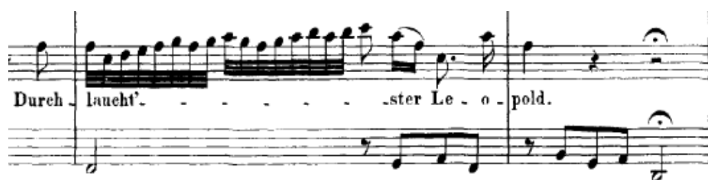
Figure 6. Coloratura on "Durchlauchtster Leopold" in opening recitative from Durchlauchtster Leopold , BWV 173a, by J.S. Bach, mm. 5-7.

The opening movement of Durchlauchtster Leopold is a very high soprano recitative heralding the "Most Illustrious Leopold." 103 Young likens it to a "birthday card message." 104 An amazing coloratura on the words Durchlauchtster Leopold at the end of the recitative (figure 6) immediately signals the importance of the honored guest, Leopold.