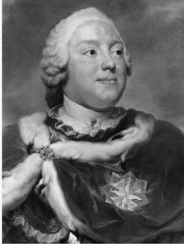
Figure 8. Painting by Anton Raphael Mengs of Prince Friedrich Christian, Crown Prince of Saxony.

after only ten weeks of ruling. In his short life he impacted Saxony as he placed the welfare of his state above his own personal ambitions. 160