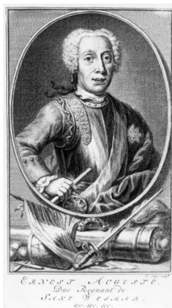
Figure 2. Duke Ernst August of Saxe-Weimar.

two. While Bach was court organist and chamber musician, records show he belonged to the group of “joint servants.” This indicated employment by both dukes, and payment from the joint treasury. 38 Musicians were regarded as servants and Wilhelm had decreed even before Bach’s arrival that members of the court Kapelle were allowed to make music in the Rotes Schloß only with permission from him. 39 Later Wilhelm declared anyone participating in events without his permission was subject to fines and arrest. Somehow Bach managed to elude or ignore all of this, perhaps justifying his attendance at musical events in the Rotes Schloß as a private music instructor to Duke Ernst August (figure 2) and Prince Johann Ernst. 40