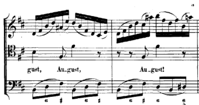
Figure 19. Example of calling the name August, complimented by wave motive in aria “Jede Woge meiner Wellen,” from Schleicht, spielende Wellen , BWV 206, by J.S. Bach, mm. 49-50.

Wellen ruft das golden Wort August. 258 The German ruft (it calls) is usually carried by an upward movement of the notes or is at one of the highest pitches in the phrase to represent the waves calling out. The name of Augustus is sung emphatically at the end of the phrase where it appears, giving the name even more of a feeling of importance. To further accentuate the name of Augustus in measures forty-nine and fifty, August is sung to a leap of an octave so the tenor may “call” his name in song. The octave leap is sandwiched in between the wave motive played by Violin I and a simplified version of the wave motive in the continuo (figure 19). The name August is sung eight times in various ways in the “A” section of the aria.