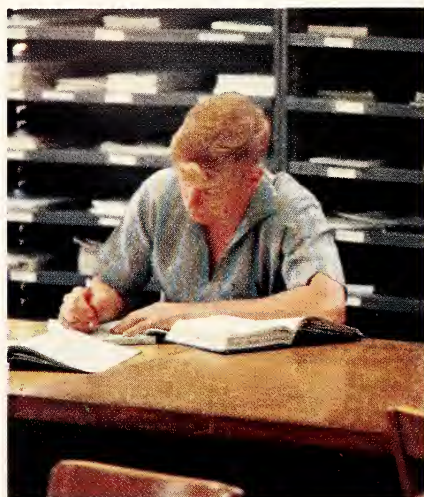
A college student makes prudent use of library facilities in writing the papers necessary to complete a college education.