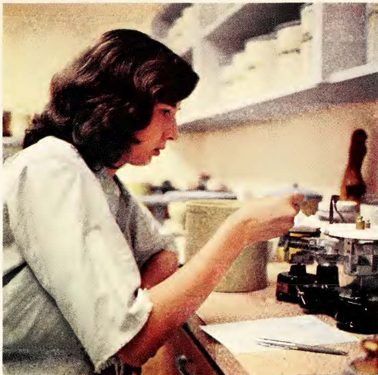
Critical measurement of materials is required in many areas of study, including a preparation of ceramic glazes in a ceramics class.