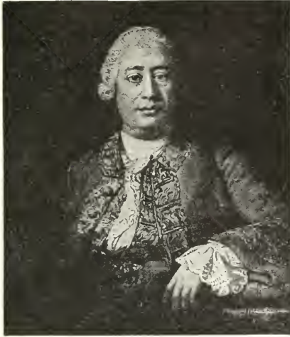
HUME. (Original 11x14 in.)

The portraits, which are 11 x 14 in., have been taken from the best sources, and are high-grade photogravures. The series is now complete.