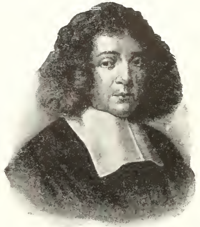
SPINOZA. (Original 11x14 in.)