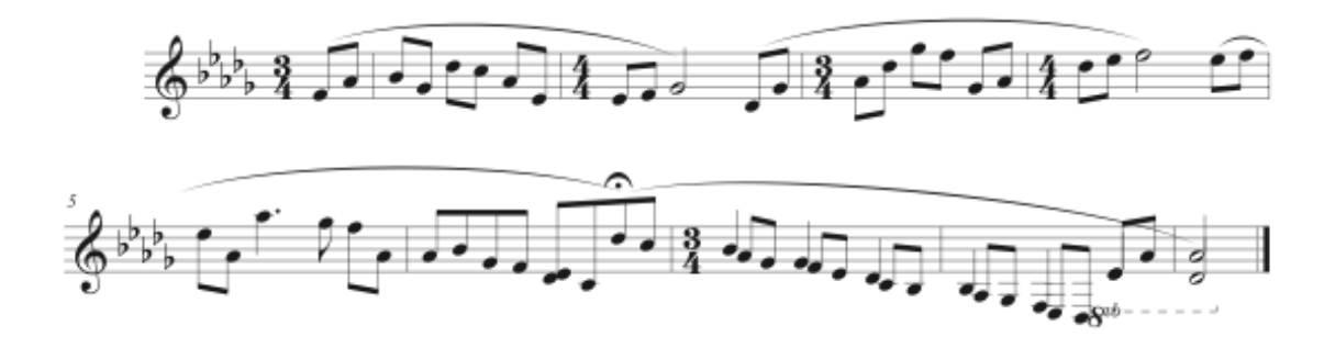
Figure 1.2. Whitacre, October, A Theme

From the beginning, the mood of October is one of stillness and serenity. The piece begins with a sustained B-flat in a solo clarinet, over the gentle sound of tinkling wind chimes. This sound continues into the entrance of the solo oboe, accompanied by the remainder of the clarinet section in the key of B-flat minor. Whitacre orchestrates the rubato in this solo by using a 5/4 time signature. In all reality, the music is in 4/4 with an extended pause or breath before each statement. After this seven-measure introduction, a two-measure interlude gradually brings in the remainder of the ensemble with a flowing chain of eighth notes that is reminiscent of the autumn wind. This wind blows in the first statement of the only recurring theme of the piece (see fig. 1.2).