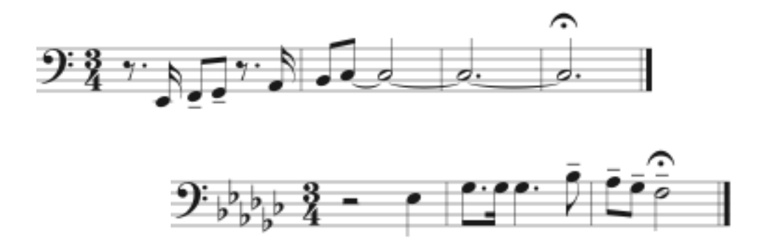
Figure 3.1. Respighi, Huntingtower , Opening motives

Huntingtower is a thoroughly romantic work, containing ten distinct motives and utilizing an enormous variety of keys, modes, and chords. The composition can be broken down into three main sections: an opening section, a lengthy development section, and a recapitulation or closing. The opening section itself (through measure 51) contains three smaller sections: an introduction (first nine measures), an expansion (measures 10-41), and an eight-measure chorale that ends by transitioning into the B section (measures 42-51). In the introduction, two motives are exposed upon which the rest of the composition is based (see fig. 3.1).