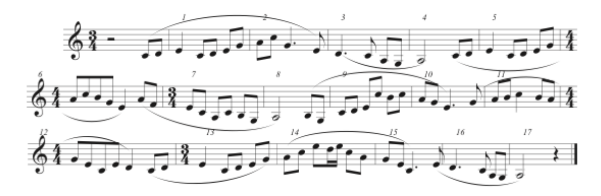
Figure 2.7. Jacob, An Original Suite, Mvt. 2 Theme

The second movement contains only one theme, but it is an astonishing seventeen measures in length (see fig. 2.7).