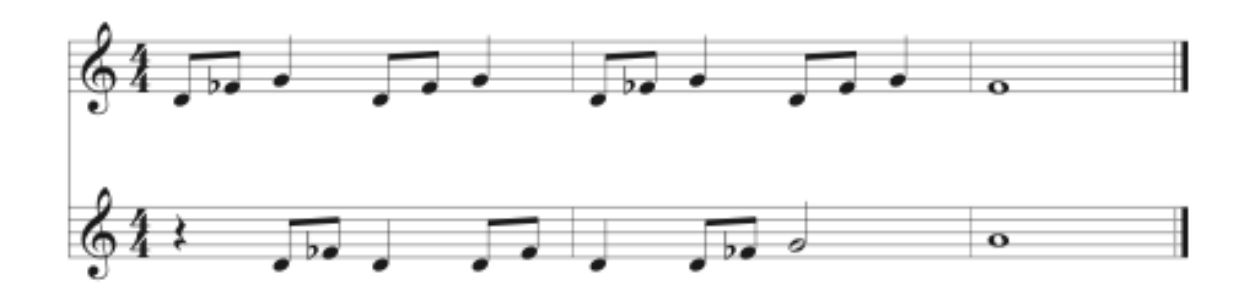
Figure 1.3. Whitacre, October, hocket figure

repose (each cadence is disturbed by the beginnings of the next idea.) This moment is no different. At the instant that the A theme reaches its conclusion, trombones and bassoons, later joined by the trumpets, begin the transition to the next section with a hocket figure (see fig. 1.3).