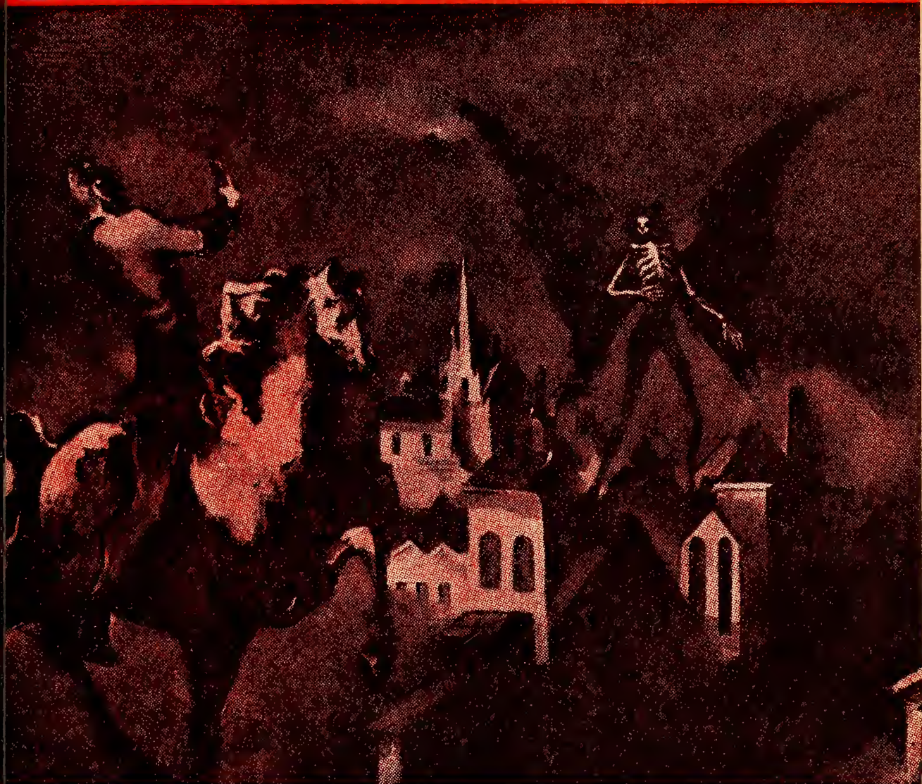
"THE WINGED GUIDE"