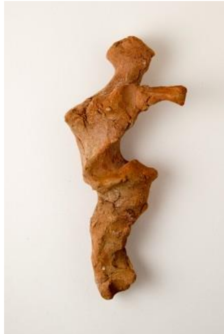
Figures 3 & 4: Example of Mellors's clay sculpture