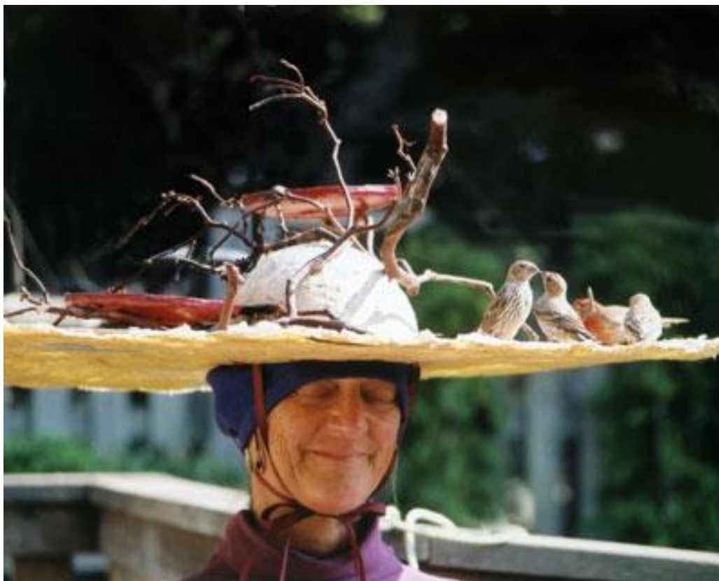
Figure 1: The Birdfeeder Hat

Fielder applies Cohen's expansive approach to sensorial experience by creating artworks that invite people to experience the exhilaration of intimate bodily interactions with neglected components of their watersheds. The Birdfeeder Hat: Seeding Watershed Awareness (2003), for example, consists of a hat that Fielder meticulously designed to activate and intensify these connections. For six consecutive weekends, at different public locations in northern California, Fielder tied to her head a hand-made hat with a sturdy three foot rim that served as feeding station for birds (Figure 1). Then she assumed a behavioral mode that is an anomaly in contemporary culture. She did not work. She did not sleep. She was not bored. She did not consider this a waste of time. She merely sat quietly and inconspicuously until birds ceased seeing her as a threat. Their arrival was proof that she had become a safe and nourishing component of the landscape.