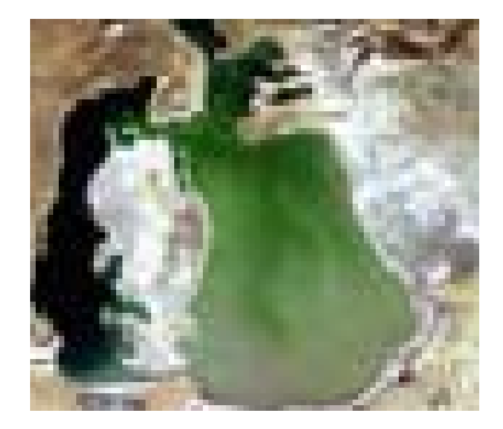
Figure 4. Aral Sea as a two lakes (picture has been taken from space)

Exacerbating the situation is misuse of remaining water resources. The research have proposed is an investigation of current water use in a small rural cities in the Aral Sea disaster zone, as a means of devising a rational water use model rural villages of Uzbekistan.