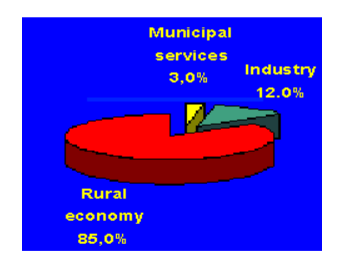
Figure 3. Water consumption in Uzbekistan and other Central Asian countries

General water consumption in the republic is 62-65 km3 per year, about 36 km3 per year from the main rivers of Amu Darya and Sir Darya. The rest of the water consumption is from small streams, underground sources, etc.