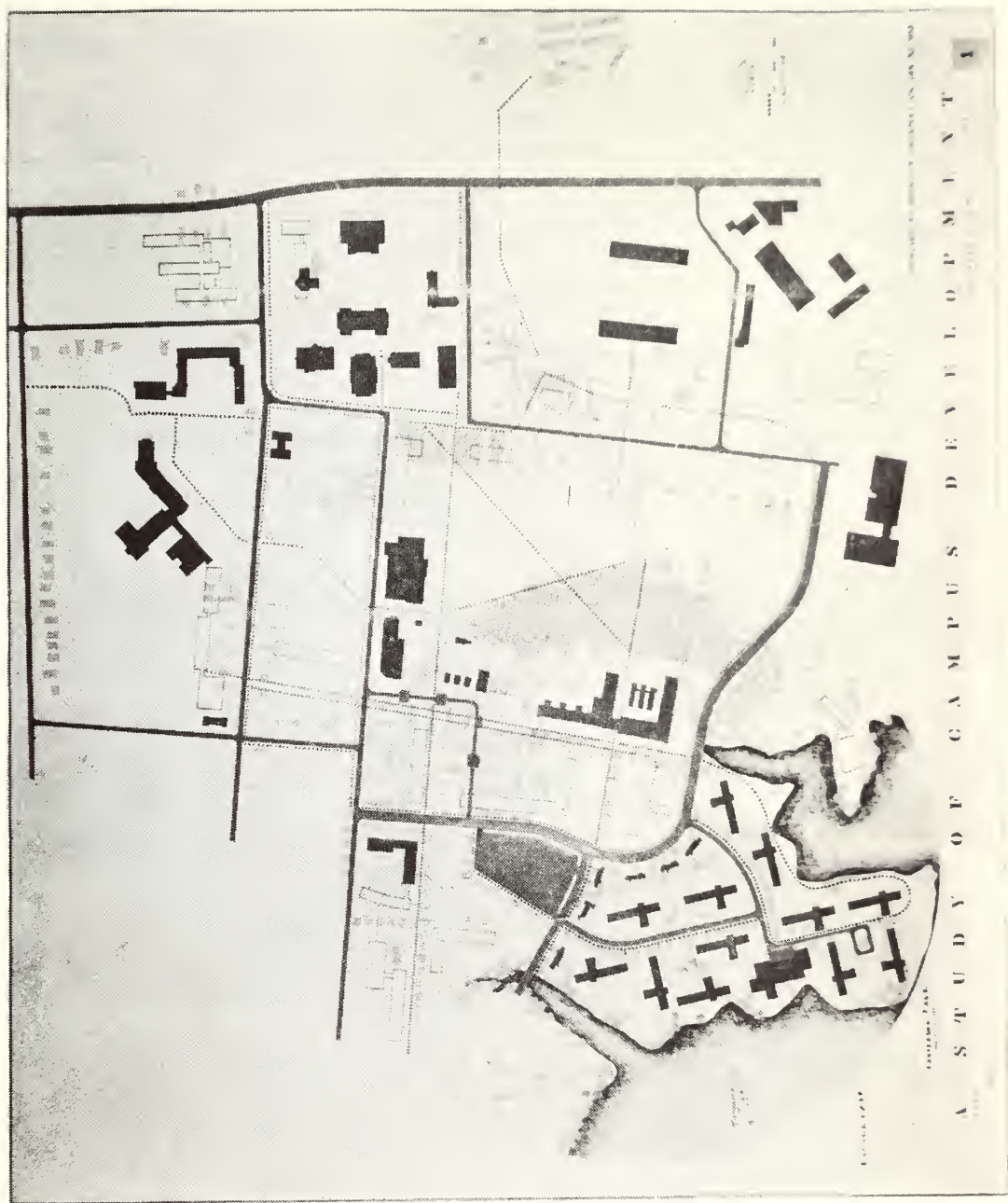
FIG. 1.—A STUDY OF CAMPUS DEVELOPMENT APPROVED BY THE BOARD JANUARY 30, 1956