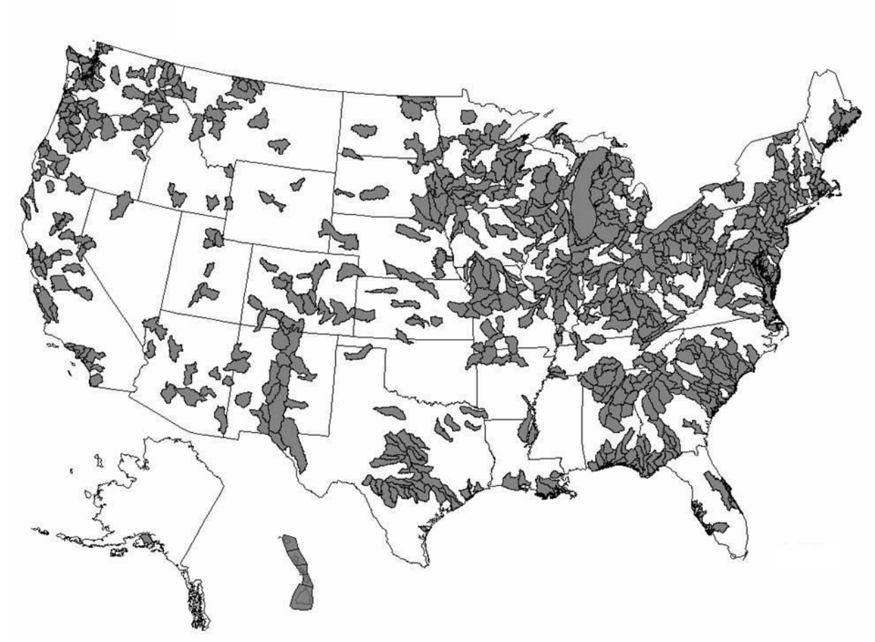
Figure 1. Watershed partnerships documented in the Conservation Technology Information Center Database.