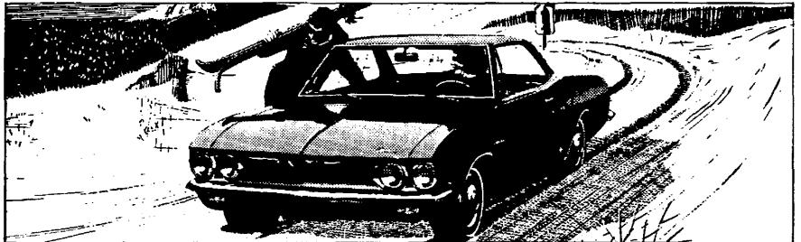
CORVAIR—The only rear engine American car made. Corvair Corsa Sport Coupe

moved forward to give you more foot room. So, besides the way a '65 Chevrolet looks and rides, we now have one more reason to ask you: What do you get by paying more for a car—except bigger monthly payments?