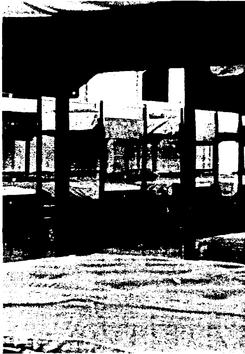
PATIENCE, PATIENTS - Photo shows the vacant former dormitory that will house the SIU Health Service next month. Would-be patients have already come to the unoccupied building seeking treatment.

There will be no advance ticket sales for the event. They will go on sale at 6:45 p.m. Saturday at the south ticket window. Only the south doors will be used at the meet.