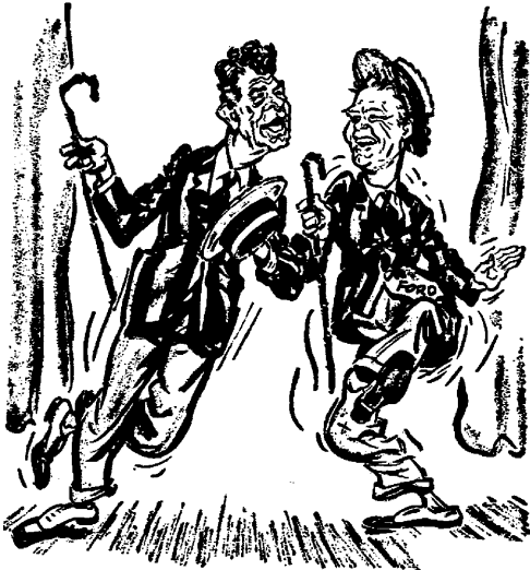
Crockett, Washington Star