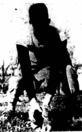
GOOD FIELD—GOOD HIT