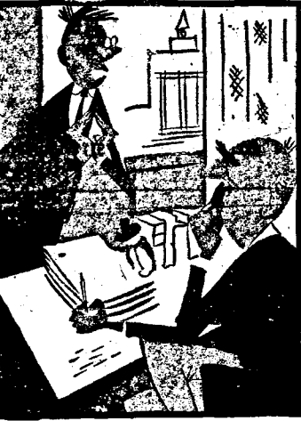
"But professor... wouldn't it be worth an 'A' just to see my face light up?"

Three out of four traffic accidents happen in clear weather on dry roads.