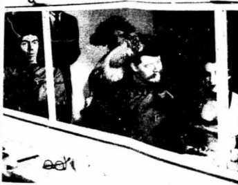
"Through the looking-glass" to another world — in this case, the world in Shakespeare's time. Cast members of "Twelfth Night," the Southern Players' winter production, wait in the dressing room for their cues to appear.