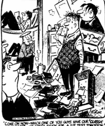
"COME ON NOW—WHICH ONE OF YOU GUYS HAVE OUR CLASSIC COMICS?—WE GOTTA STUDY FOR A LIT TEST TOMORROW."