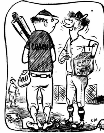
"I've been practicing catching flies like you said, coach, but I think I caught some bees, too."