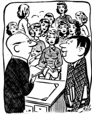
"Even though I'm flunking, Professor Snarf, I always look forward to attending your class."