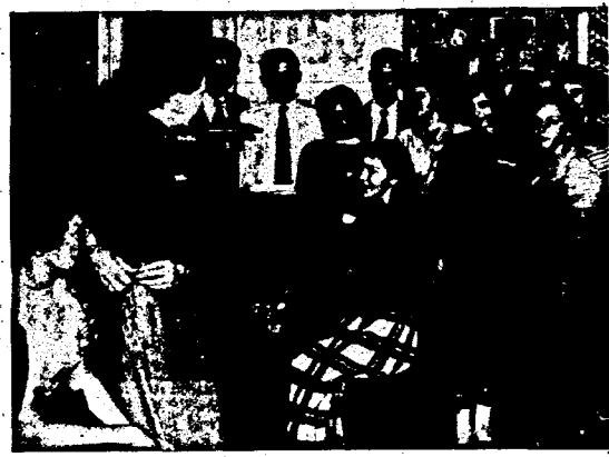
DELTA SIGMA EPSILON pledges were guests of honor at a party given by Tau Kappa Epsilon fraternity last week.