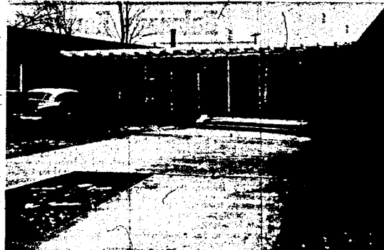
CONSTRUCTION on the addition to the Student Center, which is shown above, is hoped to be completed by the beginning of spring term. This interior will be decorated in contemporary style employing modern furnishings, paint schemes, and fabrics to harmonize with the front wall which will be made entirely of glass.