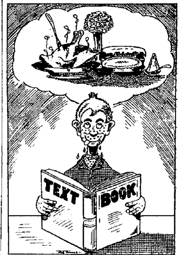
"Our Minds Begin to Wander"

A big, tall, gawky, dangling looking nigger about six feet tall, walked into a country grocery store and said, "Mr. Jones, kin I use your telephone?" "All right, nigger, help yourself." "Gimme leven seven forty-four," says the nigger into the phone. "Is dis you, massa Willie,—Yes, dis is Buddie—Say, Massa Willie, Old Maude done stopped in front of Mr. Jones' store and won't go no fudder. Yas, sir, yas, sir, I done wore the whip out on 'er. Yas, sir, yas, sir, I done por'd sand in her yars. Yas, sir, yas, sir, I done built a fire under 'er. She just moved up a little and de wagon it burnt up all 'cept one wheel. No, say, I didnt twist her tall. No, sar, he ain't dead yet; de ambulance done too him 'way.