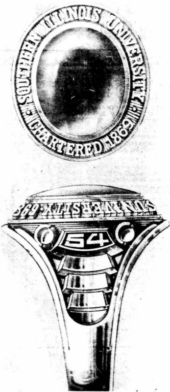
PICTURED ABOVE is the class ring design that has been used during the past few years at SIU. Many feel that its design is not distinctive enough to the school and want a new design.