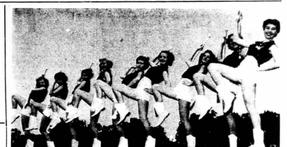
A GROUP OF teenage majorettes strike an energetic pose as they performed in the Chicago-Land Festival competition. Over 70 were entered in various phases of musical activity Saturday, which coincided with the Music Under the Stars held in the evening.