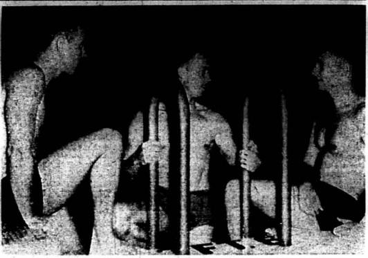
UNDEFEATED AT HOME