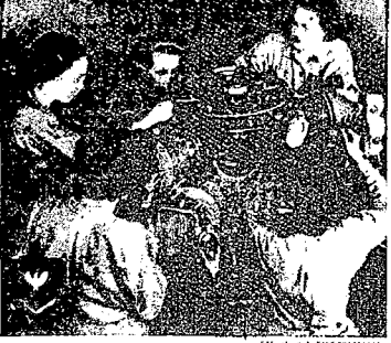
These girls, too, wear the trim Navy blue Mainbocher uniform when they're on duty. But when they're doing the practical work—working job with the WAVES they wear specially designed coversalls. They appear a trifle new at the game, tinkering with an airplane engine, but that's because they are only students in the U. S. Naval Training School at Norman, Okla. After four months' training, following indoctrination, they wear the rating badge shown at the top—Aviation Machinist's Mate, Third Class. There are many important jobs in the WAVES for mechanically-minded, patriotic American girls 16 to 36 years old, who have had two years' high or business school training.

W. A. A. NEWS. W. A. A. NEWS. W. A. A. NEWS. W. A. A. NEWS. W. A. A. NEWS. W. A. A. NEWS. W. A. A. NEWS. W. A. A. NEWS. W. A. A. NEWS. W. A. A. NEWS.