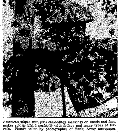
American sniper suit, plus camouflage markings on hands and face, makes soldier blend perfectly with foliage and many types of terrain.