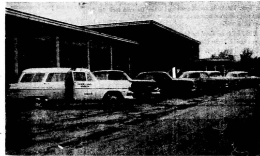
Six vehicles of SIU's fleet stand poised and ready for a day's work in front of the Physical Plant.