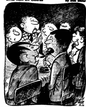
"Naww—Th' candles aren't to impress you guests—they make th' food easier to eat."