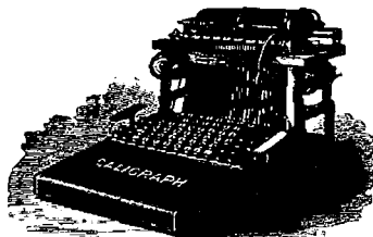
Writing Machine Supplies of all Kinds.

The New York Store invites attention to its complete and carefully selected stock of spring dry goods, notions, etc.