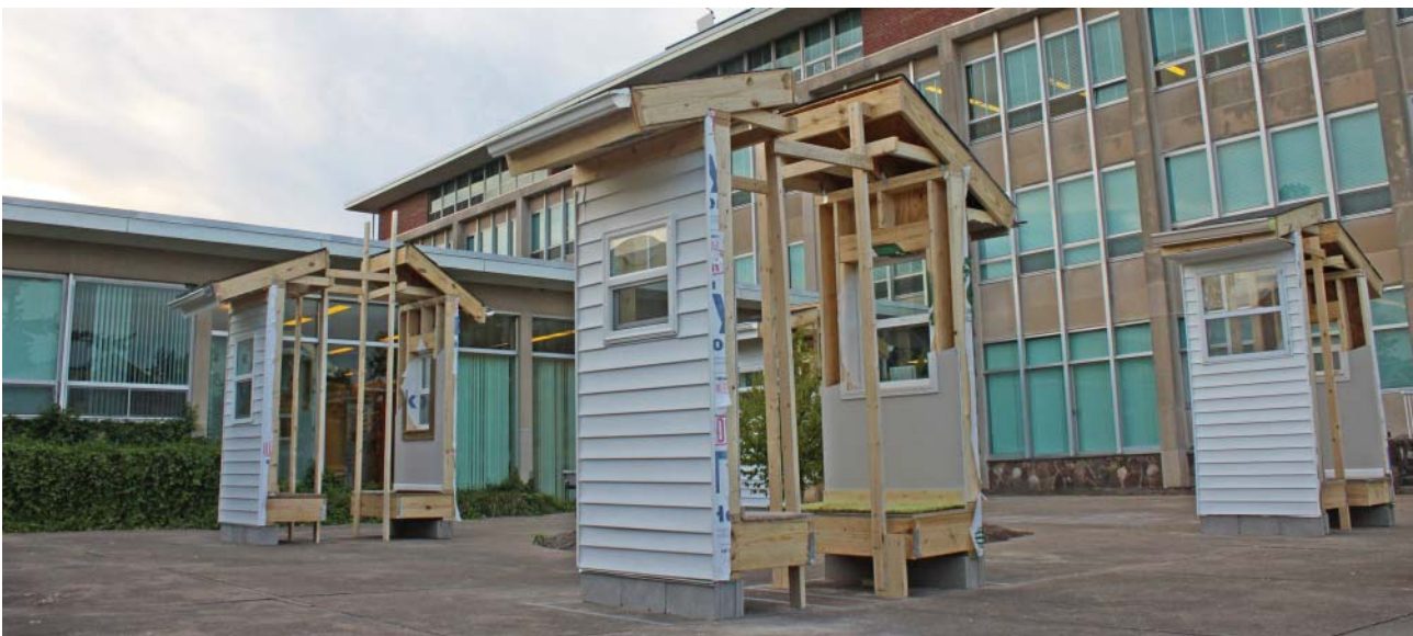
Figure 5: Finished wall sections - 2012.

Overall, the student's work to-date has been successful (Figures 5 and 6) and the future of design/build in this foundation technology course is bright. A third iteration of the project is currently underway that looks to maximize the benefits of the builds from 2012 and 2014. Working in the same environmental education facility, the class is charged with designing and building restroom enclosures for a series of six grant-funded composting toilet units that will be distributed throughout the property. This arrangement allows for the class to be divided into six groups of eight to nine students all working on separate constructions in a similar fashion to the work done in 2012. The work itself, however, falls directly in line with the community-based efforts experienced in 2014 and carries similar issues of being a real project with a client, a timeframe, and a user group. The hope is that this version of the project will serve as a bridge between the previous projects and as a catalyst for new projects in the future. Based on this study, the coming years will likely see new projects that enhance the learning process of the students in the School of Architecture. Through their first hand participation in the construction of our built environment, they will become more knowledgeable about the realities of architecture as they move on to their professional careers.