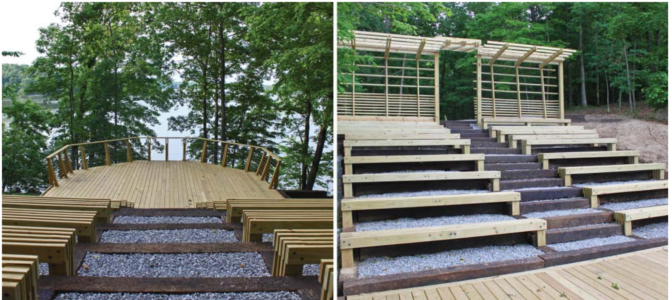
Figure 6: Finished amphitheater - 2014.