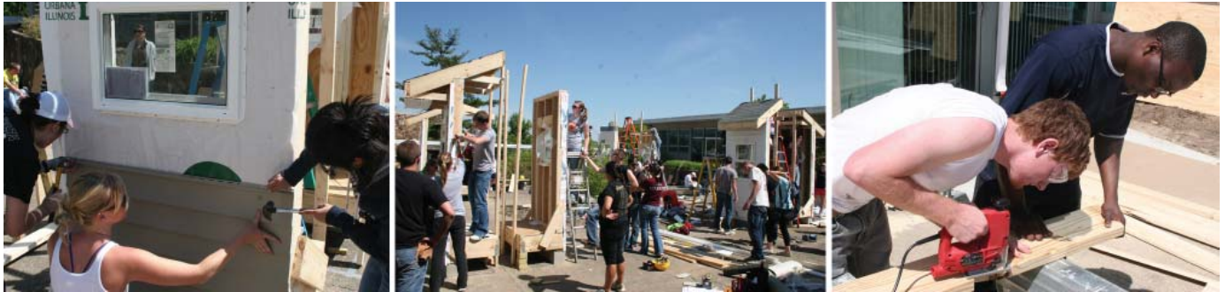
Figure 1: Students participating in the courtyard build project in Spring 2012.

The working process for the project emphasized translation. Each group completed the design of the wall, generated a parts list from their design, created a cost estimate from the parts list, and, finally, developed a storyboard detailing the construction sequencing and scheduling. After all submittals were approved by the faculty, the student groups built their wall sections at full scale in an outdoor lab space on campus. The build was accomplished in a single day, with demolition coming the following week (Figure 1). After completion of the construction project, each group was required to submit a photo narrative of the process. The same project was repeated in the spring of 2013.