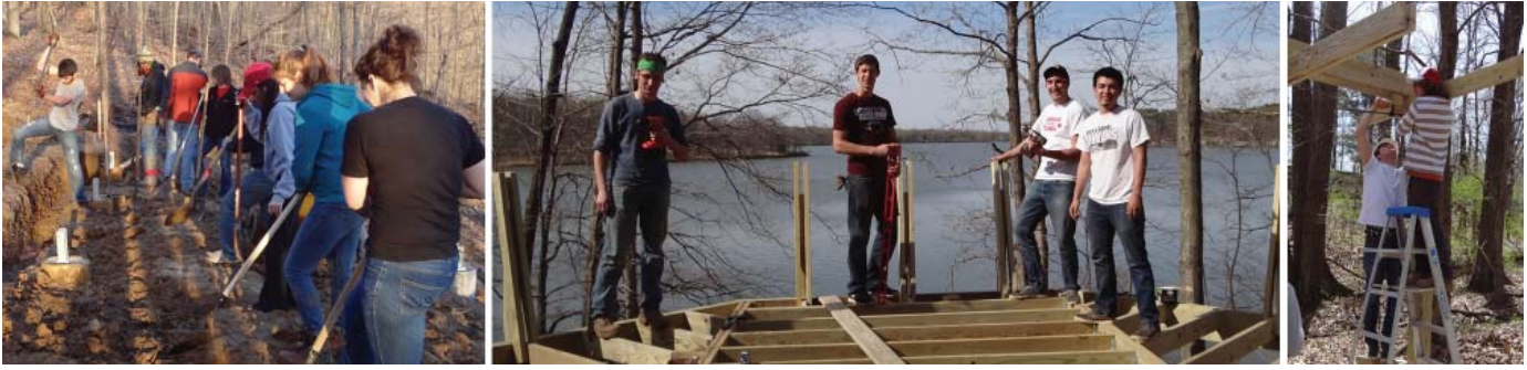
Figure 2: Students participating in the amphitheater build project in Spring 2014.