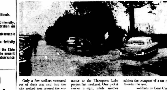
Only a few strikers ventured out of their cars and into the rain soaked area around the entrance to the Thompson Lake project last weekend. One picket carries a sign, while another advises the occupant of a car not to enter the area.