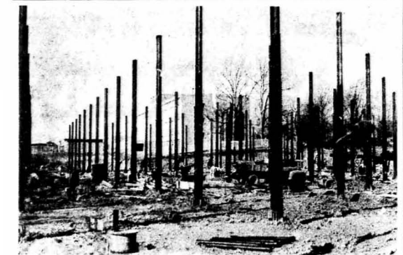
FLOORS and ceilings of the new library building now under construction at SIU will be supported by 105 columns extending from the sub-basement level to the roof. There will be no supporting walls in the structure. The library will be pressed into the winter when the exterior and 42 percent of the interior is finished.