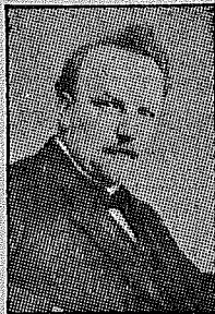
ARTHUR DREWS Professor of Philosophy at Karlsruhe.